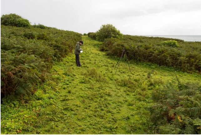
Quadrat 17 – 2016: